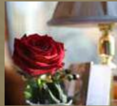
TABLE NAPKINS & CORPORATE BRANDING

Northern Belle will provide fresh flowers as table centres. These can be done with a destination and route theme eg Scottish, Welsh, English or seasonal styles in corporate colours. These are included in the charter hire cost.